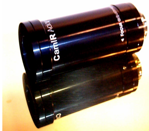
CamIR adapter 1550

The CamIR adapter is available as an OEM product only. Please contact AST for customised badging and volume pricing.