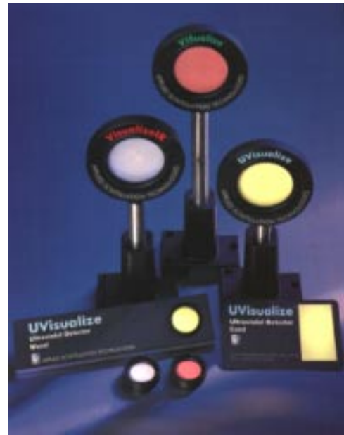
AST's Visualize product range